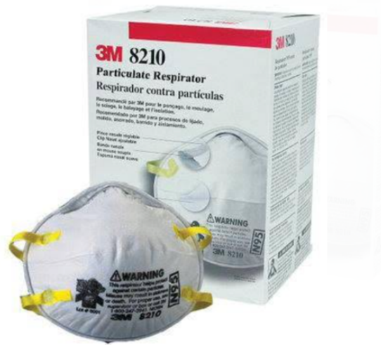
N95 Face masks