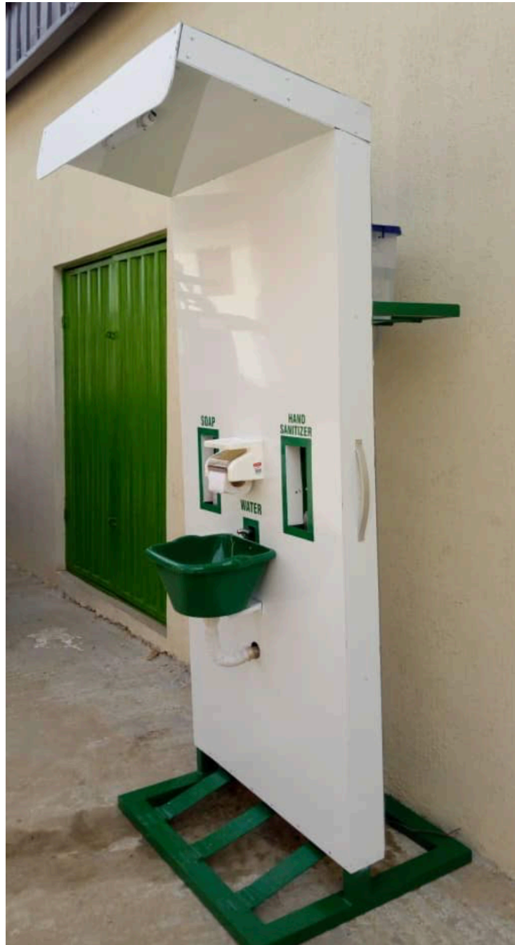
Foot pedal sanitizers

In such turbulent times, personal safety is of utmost importance. We offer a range of products to keep you and your employees, and loved ones safe and sound.