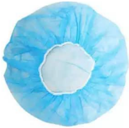
Bouffants (Hair covers)